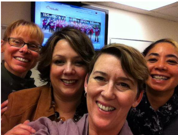
Picture 2. REALIZE 15 a team of presenters from BC

"Everything was great; appreciate how quickly tech problems were resolved. The moderators were outstanding. "