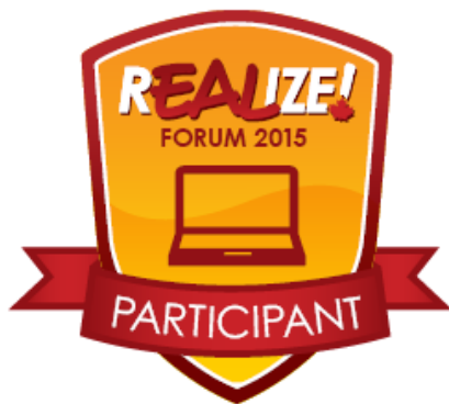
Picture 1. REALIZE 15 Participant badge

This year, seven hundred ninety eight (797) participants registered for the REALIZE! Forum.